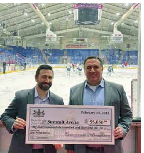
$55,650 for First Summit Arena to upgrade seating at the 4,000-seat entertainment venue.