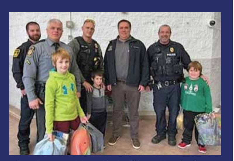
Rep. Burns participated in the "Shop with a Cop" program and believes the excitement and gratitude shown by the kids embodied the Christmas spirit.