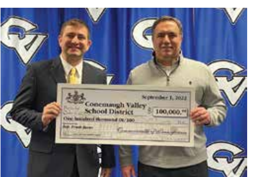
$100,000 to Conemaugh Valley School District to help fund their football stadium lighting project.