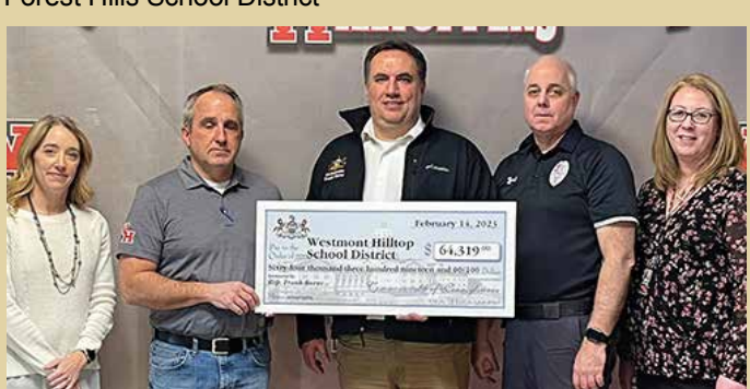
Westmont Hilltop School District